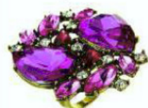
Diva pink stone ring $19.99