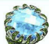
Thomas Sabo ring $549