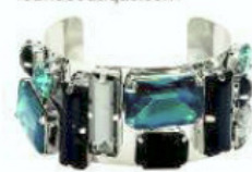
Adorne Jewel cuff $79