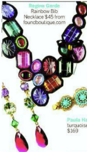
Regina Gerde Rainbow Bib Necklace $45 from foundboutique.com