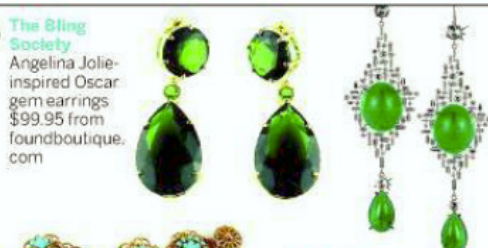
The Bling Society Angelina Jolie- inspired Oscar gem earrings $99.95 from foundboutique. com