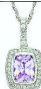
Pink diamond simulant pendant in white gold $330 from Secrets Shhh...