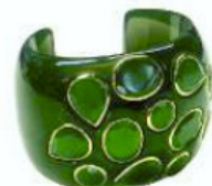
Isharya Green Polka Cuff $395 from frockshop.com.au