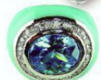
The Bling Society Park Sienna Ring $149.95