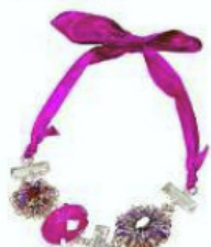
Adorne pink jewel neckpiece $85