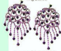
CC Skye @ Frockshop pink crystal earrings $325 frockshop.com.au