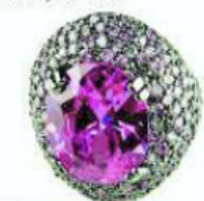
The Bling Society Olivia Ring $89.95 from foundboutique.com