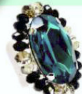
Adorne jewel ring $29