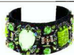
Adorne ribbon jewel cuff $75