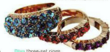
Diva three-set rings $19.99

Stockists Stefano Canturi, 1300 883 883, canturi.com; Paula Hall, paulahalldesigns.com.au; Secrets shhh..., Broadway on the Mall, Chermside and Garden City or secrets-shhh.com; foundboutique.com; Renee Blackwell Design, reneeblackwelldesign.com or 5494 4895; Diva, diva.net.au; Lydia Jewels, lydiajewels.com; frockshop.com.au; Thomas Sabo, (02) 9417 6286; Adorne, 3846 6366