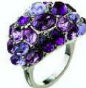
Diva purple stone ring $14.99